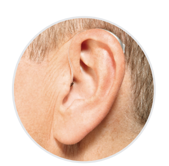
Muse iQ is available in a variety of styles and colors for your ideal fit.

If you have severe to profound hearing loss, ask your hearing professional about Muse iQ Power Plus BTE 13.